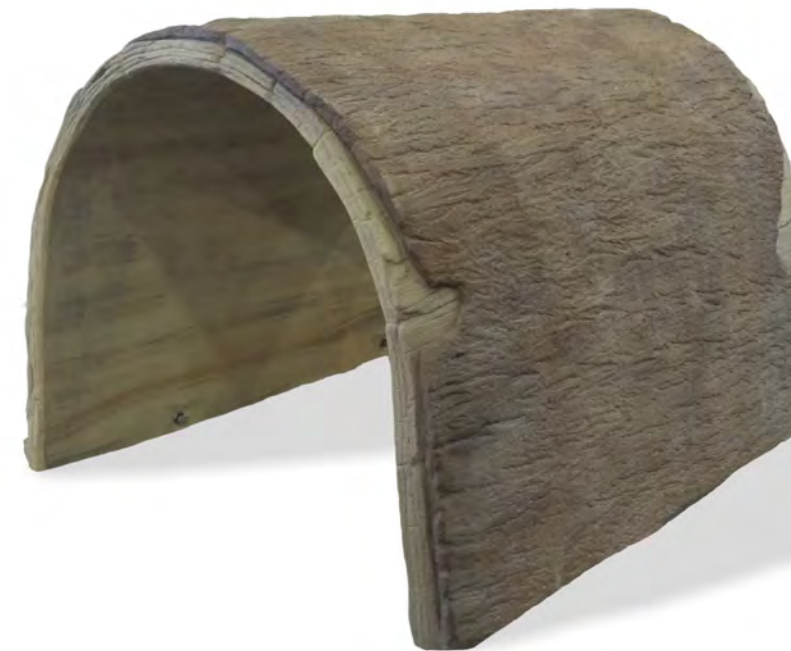
3 Hollow Log_AP008-4